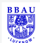
Baba Sahab Ambedkar University