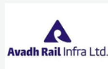
Avadh Rail Infra Ltd.