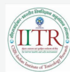
CSIR- IITR Lucknow