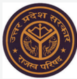
UP Revenue Department