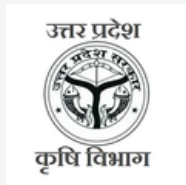
UP Agriculture Directorate

We are working with more than 150 customers across various sectors.