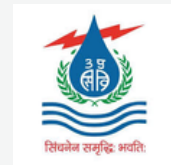
UP Irrigation Department