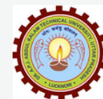
Abdul Kalam Technical University